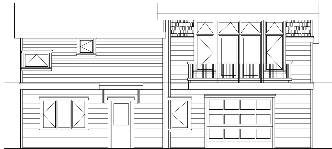
○ NORTH ELEVATION SCALE: 1/8"=1'-0"