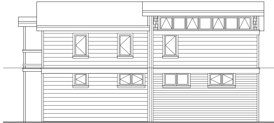
○ SOUTH ELEVATION SCALE: 1/8"=1'-0"