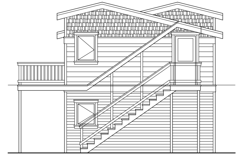
○ WEST ELEVATION SCALE: 1/8"=1'-0"